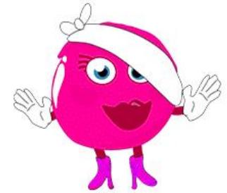
Miss Oh No