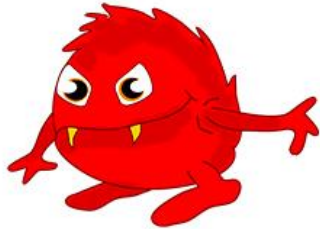
Angry Red A